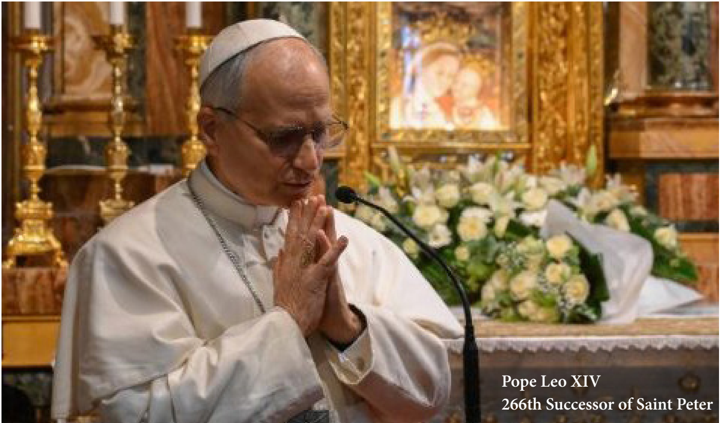
Pope Leo XIV 266th Successor of Saint Peter

69 VALLEY STREET, HILLSDALE NJ 07642 • STJOHNHILLSDALE.ORG