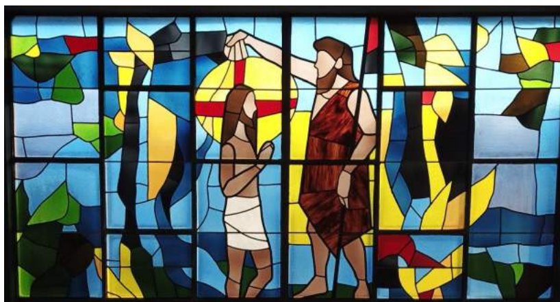
THE BAPTISM OF THE LORD BY ST. JOHN THE BAPTIST