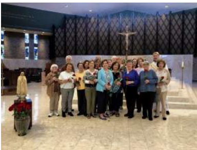
Rosary Sunday October 2018