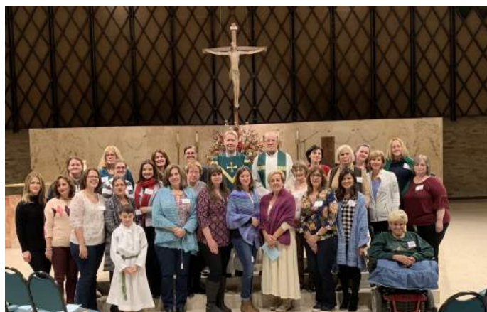
Women's Cornerstone Retreat November 2018