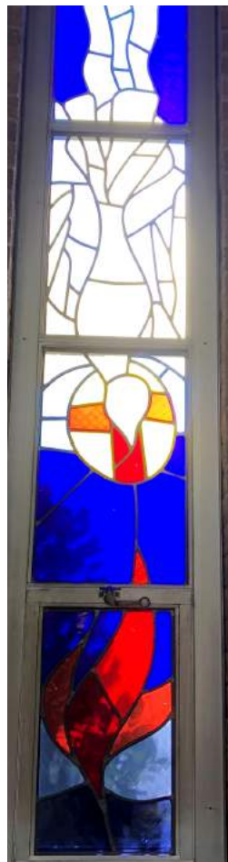
Stained Glass Window depicting the Sacrament of Confirmation— Holy Spirit (Dove), Flames