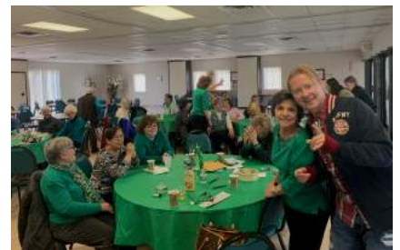
St. Patrick's Day Party