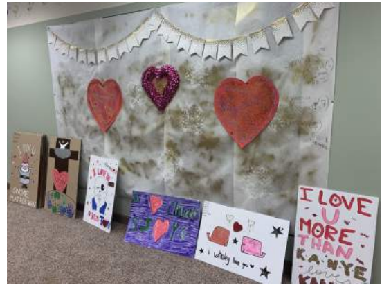
Valentine's Day Celebration February 10, 2019