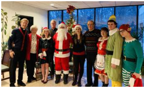
Christmas 2018 FA LA LA Celebration with Santa & Guests