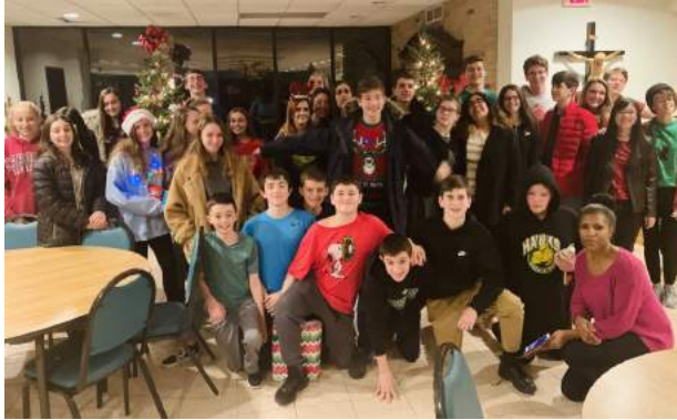
Youth Group Christmas Party and Gift Exchange December 9, 2018