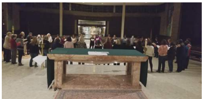
Opening prayer service at March 2019 Reunion