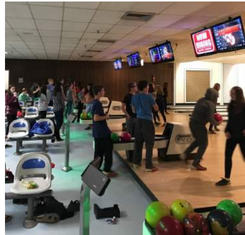
Bowling Night October 21 At Montvale Lanes