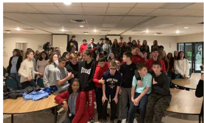
Left & above—Friendsgiving Feast November 18 Gratitude for all our blessings and friends