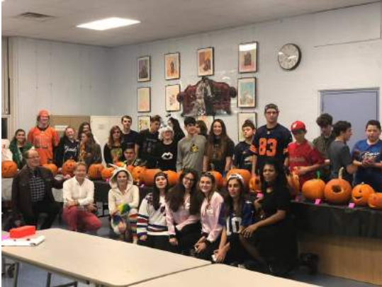
Pumpkin Carving Contest October 24

St. John's Youth Group had another busy year—both spiritual and social! The official start of the year began with a Kick-Off Bonfire on September 23, 2018. Held on the Church grounds behind the Parish Center, it featured games, food, music and more. It was open to all teens in grades 8-12. Following are photos of different activities held during the last year.